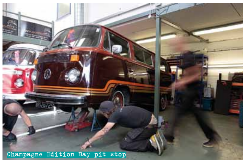
Champagne Edition Bay pit stop