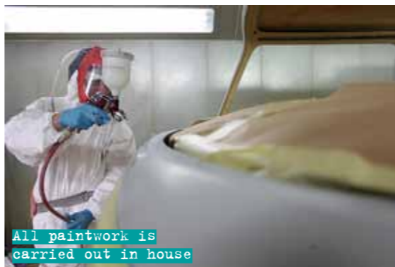
All paintwork is carried out in house

VW Kampers Ltd. Macklays Industrial Estate, Unit 21, Small Dole, Henfield, West Sussex, BN5 9XR. Tel: 01273 493032 www.vwkampers.com