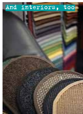
And interiors, too