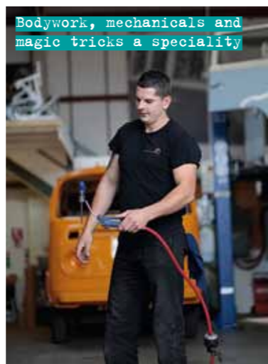
Bodywork, mechanicals and magic tricks a speciality