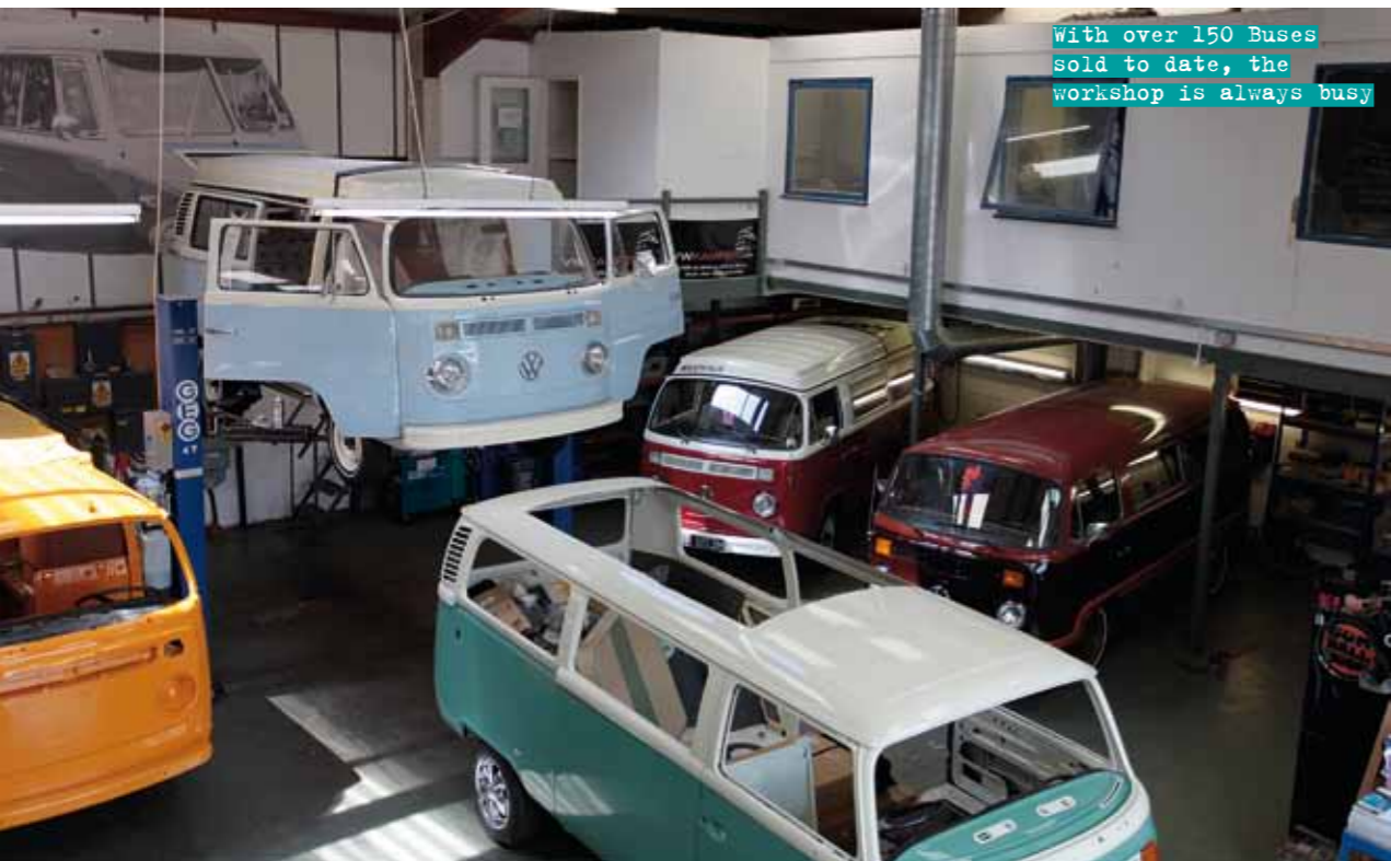
With over 150 Buses sold to date, the workshop is always busy