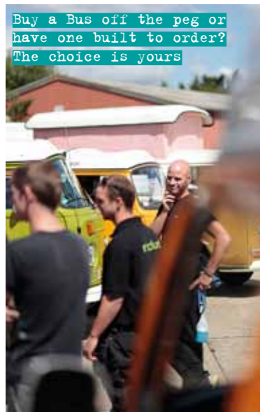
Buy a Bus off the peg or have one built to order? The choice is yours

working from an old cows' shed and one member of staff to our huge new unit with in-house paint, upholstery, media blasting room and parts department, and a team of 10 workers in just over two years," Ian told us. The key to their success has been the vehicles themselves, and their policy of only selling and sourcing the best Campers they can find and restoring them to the highest standards, then standing by their work once they've been sold. Offering a full 12-month warranty on all their work speaks volumes.