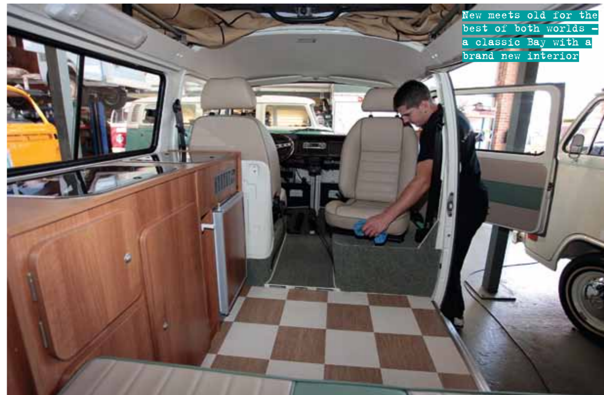
New meets old for the best of both worlds - a classic Bay with a brand new interior