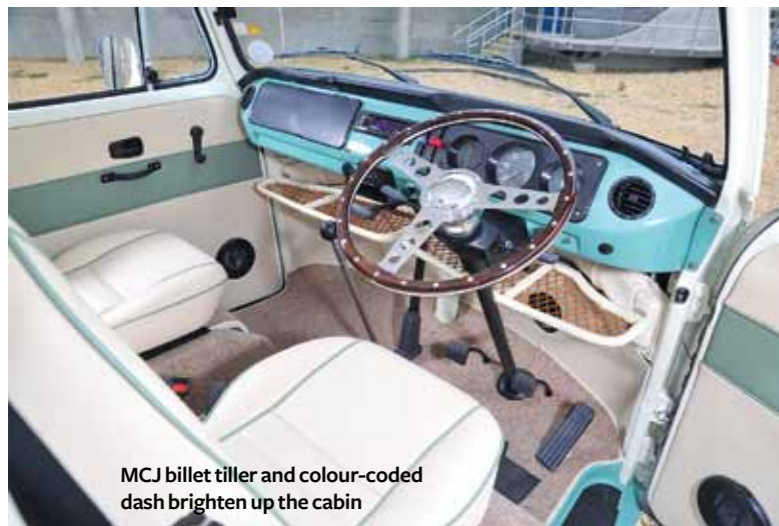
MCJ billet tiller and colour-coded dash brighten up the cabin

"We'd previously owned a sailing yacht and thought we could adapt to camping in a Camper Van. We didn't want to go down the motorhome route, though, as we wanted something we'd be proud to own, something with character. However, at our age we wanted