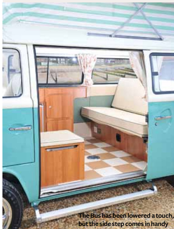
The Bus has been lowered a touch, but the side step comes in handy

To really enhance Ruby's makeover, a set of chromed SSP Fooks (replica Fuchs) were bolted up and shod in Yokohama tyres measuring 185/65 x R15 all round.